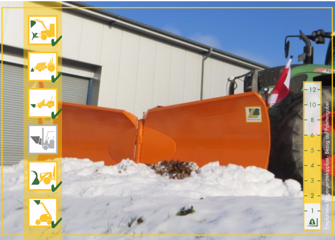
The Vario snow plough is designed to clean up low till middle snow heights on parking lots and streets.