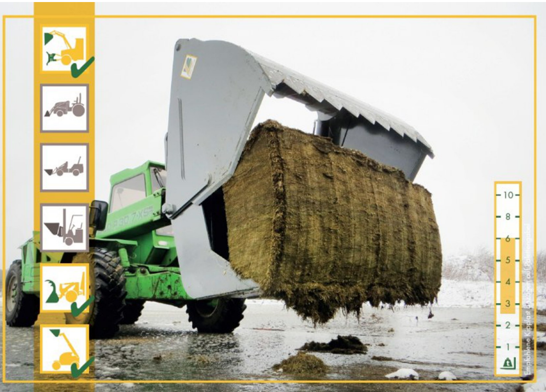
The Silagecutter with bucket is designed for clean silage stock cutting of each kind in agriculture range. It has a bucket which allows the transport of loose material.