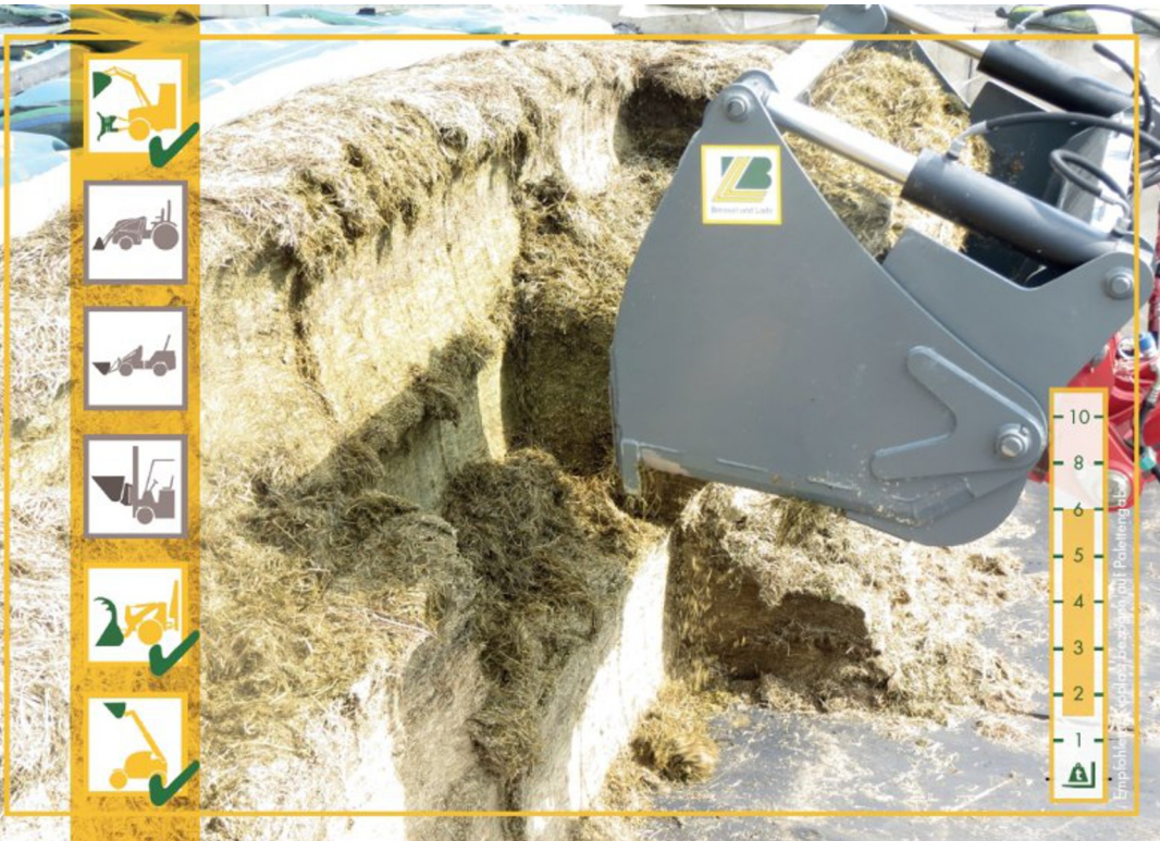
The Silagecutter with bucket is designed for clean silage stock cutting of each kind in agriculture range. It has a bucket which allows the transport of loose material.