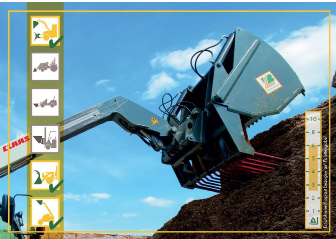
The Silagecutter is designed for clean cut of all kinds of silage. The bendsave cutting shield cuts even extrem compressed silage.