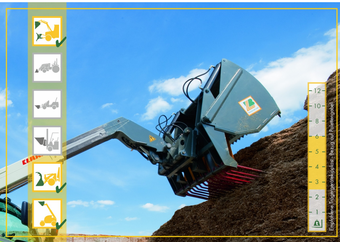
The Silagecutter is designed for clean cut of all kinds of silage. The bendsave cutting shield cuts even extrem compressed silage.