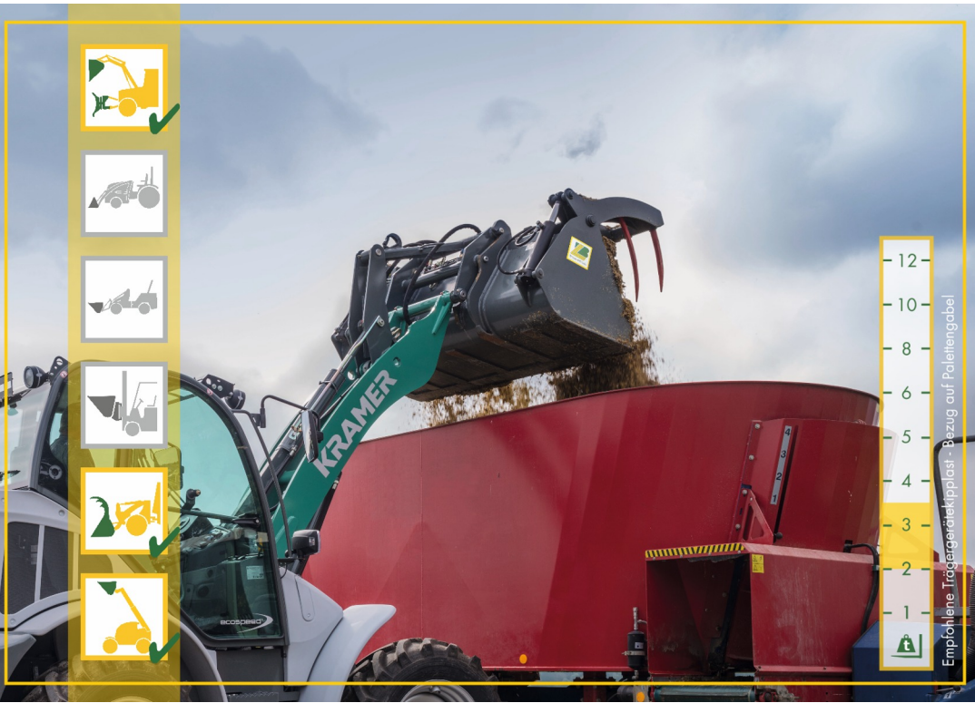
The Silagebucket is designed for collection and transportation of chopped silage.