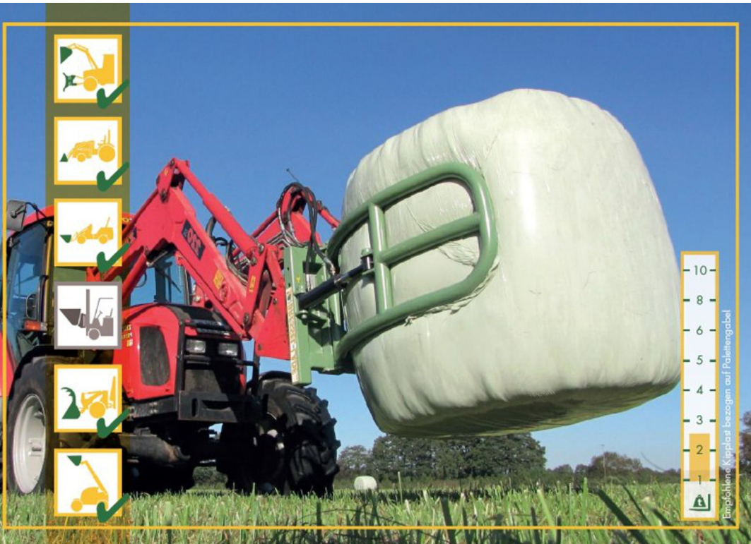
Is designed for loading of straw- and foliage round bales without damages.