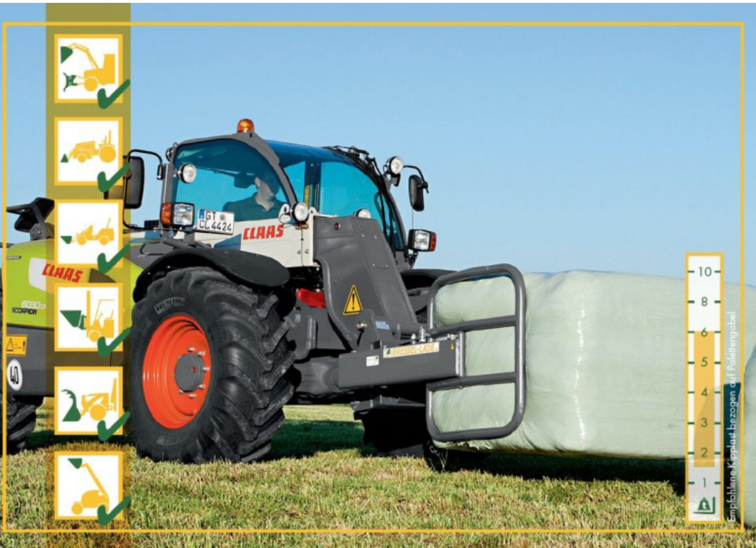
Designed for save and careful loading and transport of straw- and foliagebales in round or squared form.