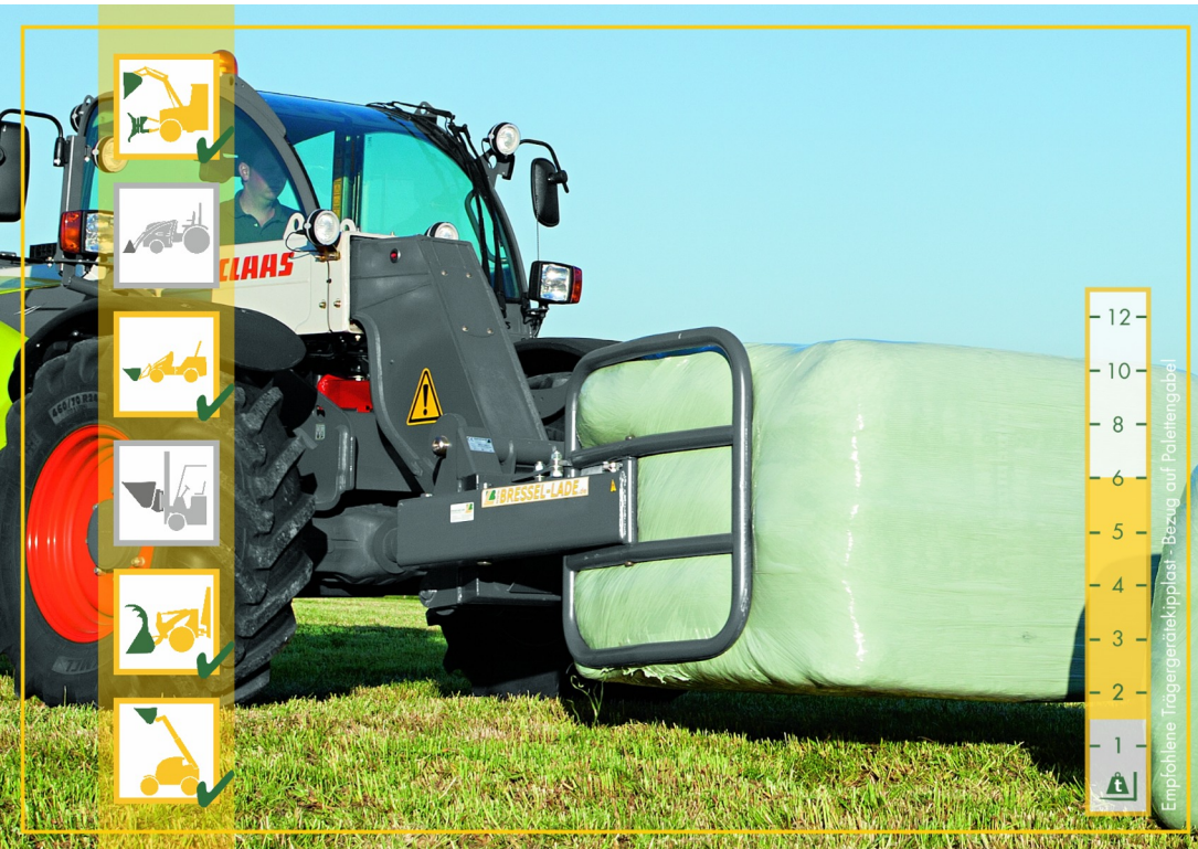
Designed for save and careful loading and transport of straw- and foliagebales in round or squared form.