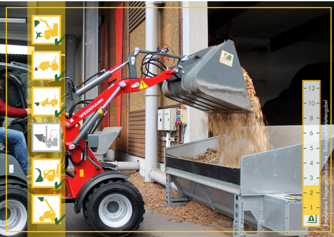
Designed for loose loading goods in agriculture branch.

YOUR ATTACHMENT SPECIALIST - www.bressel-lade.de Send us a mail to: info@bressel-lade.de