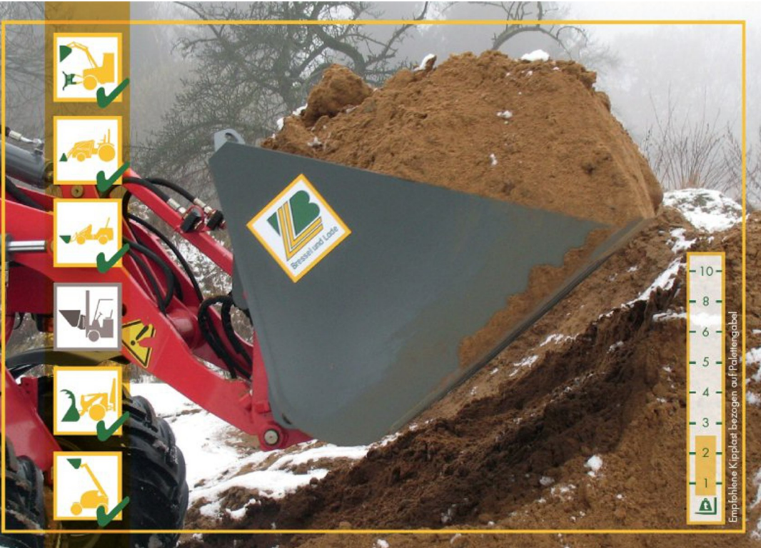
Designed for loose loading goods in agriculture branch.

YOUR ATTACHMENT SPECIALIST - www.bressel-lade.de Send us a mail to: info@bressel-lade.de