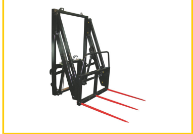
Allows the higher stacking of bale for 2m more than the loader can lift.