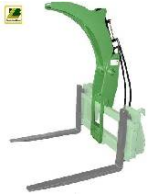
Grapple for existing pallet fork carrier