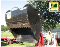
With additional bucket