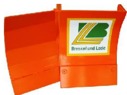
Side blade right / Extension