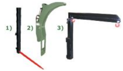
1-3 from left to right