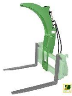
Hydraulic grapple for pallet fork